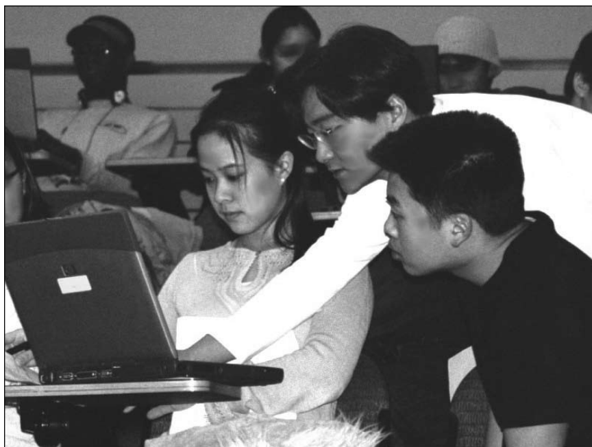
Figure 1. A teaching assistant guiding students in the studio classes.

per week of small group tutorials. No separate laboratories were conducted, as they were integrated as part of the studio classes.