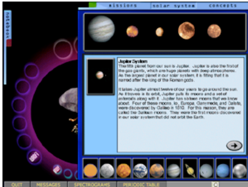
(b) Accessing the Solar System Database while researching in Alien Database